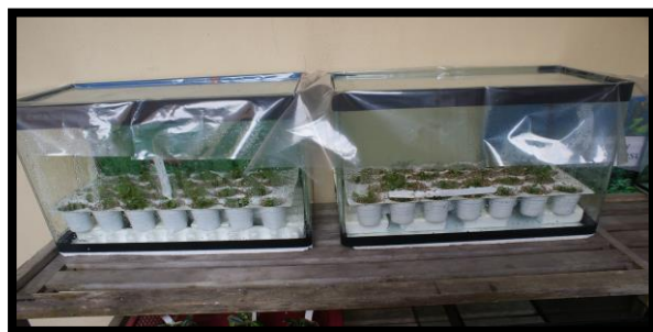
Figure 3: Glass chamber used to acclimatized Tongkat Ali plantlets