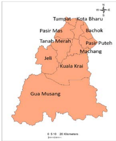
Figure 1: Map of 10 districts in Kelantan.

on studies from Crimmins et al. (2009), Chapoto et al. (2011), Anyanwu (2014), Majid et al. (2016), Lastrapes & Rajaram (2016) and others.